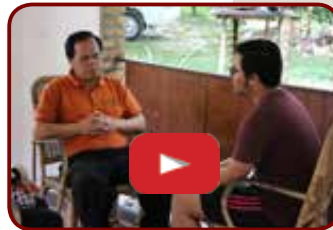
Clinic and radio