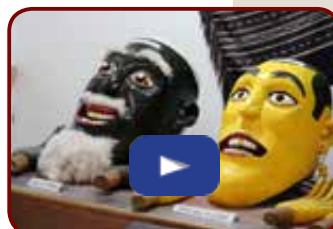
Berastagi, the museum