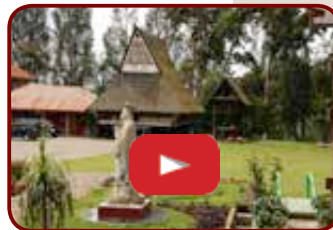
Museum and the church