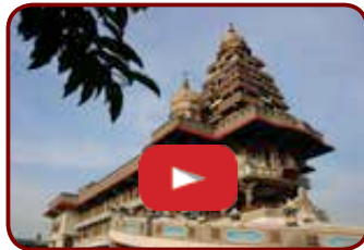
Shrine of Our Lady