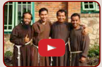
Sinaksak - formation houses