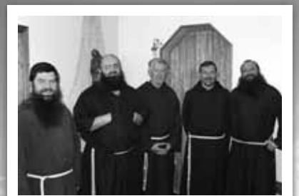
...and in Iceland

migrant workers, primarily from Poland. The brothers are busy because there is an openness to everyone. Their mastery of the Polish language helps them in the pastoral work.” “What we are doing here—summarizes the Minister—represents the principle of willingness to go where nobody wants to go.” Our presence needs to be reinforced with more personnel and the bishop is ready to give us a house and entrust to us a service in the capital. Iceland is an open island and awaits more courageous Capuchins.